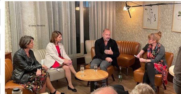
Henkel und Metro werben für Social Plastic